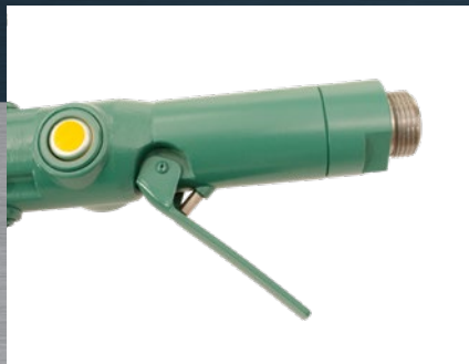
Safety lever valve or safety twist throttle