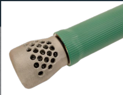
Handle with sound absorber